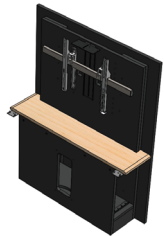
526RW-S/D/XL Section 48" W X 12.6" D X 62" H