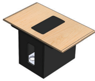
EXT32 Extension (+2 people) 48" W X 29" D X 29.13" H