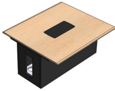
EXT34 Extension (+4 people) 48" W X 55" D X 29.13" H