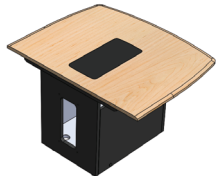
526RR Section 48" W X 37.71" D X 29.13" H