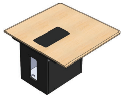
526SE Section 48" W X 46.5" D X 29.13" H