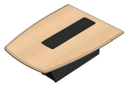
526FR Section 48" W X 67" D X 29.13" H